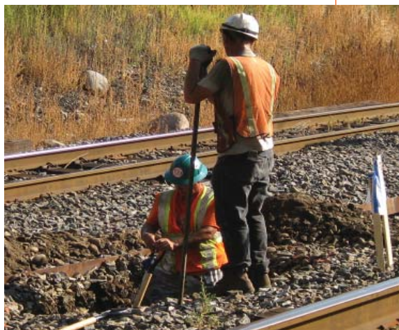
Hand Digging for Catenary Foundation.

along the railroad right-of-way parallel to 37th Avenue