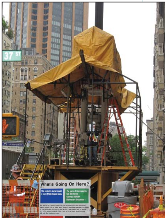
Installation of Raise Bore Machine Enclosure.

At times, it will be necessary for the contractor to occupy the parking lane and one traffic lane on Park Avenue between 36th and 37th Streets as well as the intersection of Park Avenue and 37th Street. Pedestrian access along sidewalks will be via a 5-foot wide walkway. Access to building entrances will be maintained at all times.