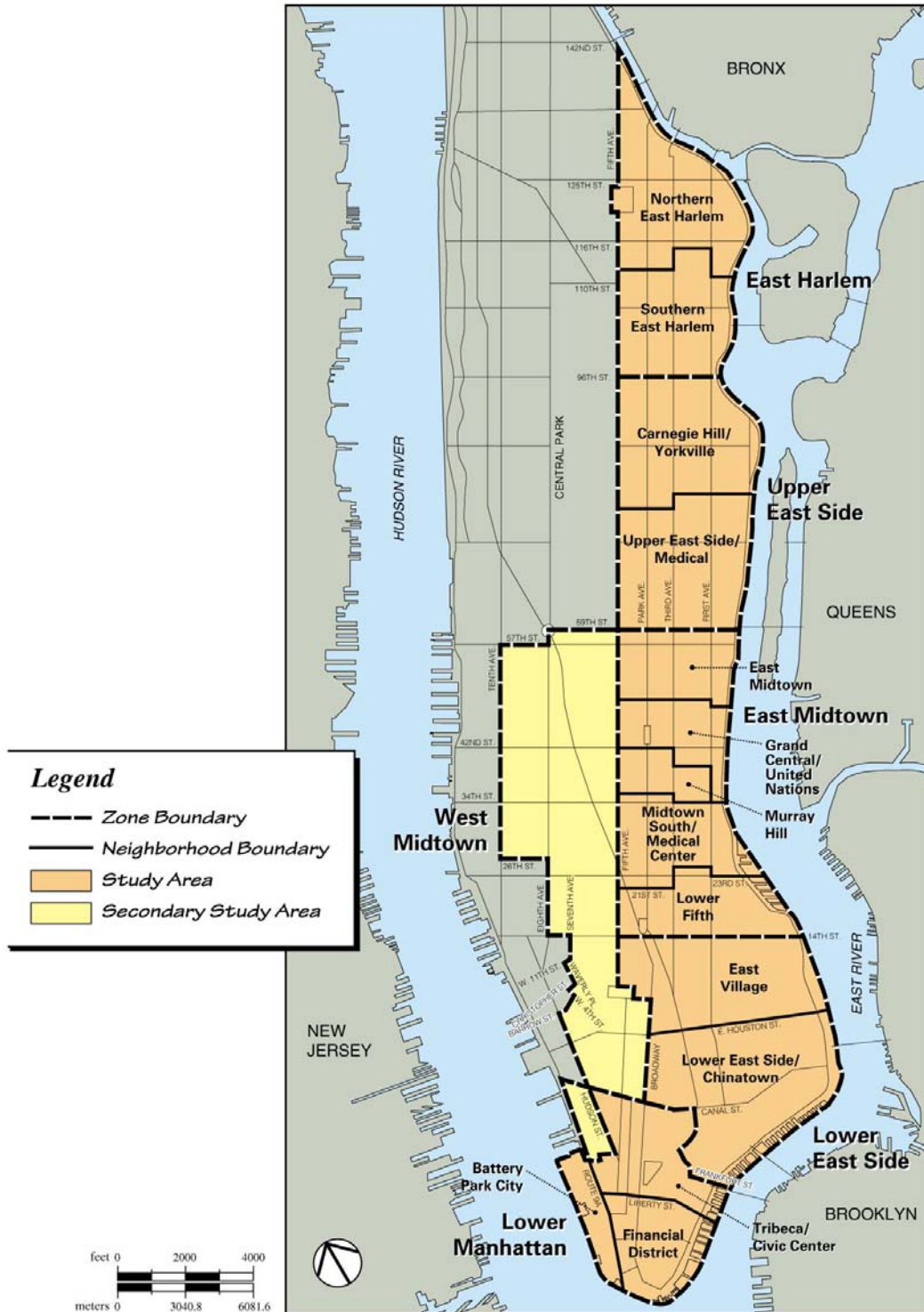
Figure 1 Study Area