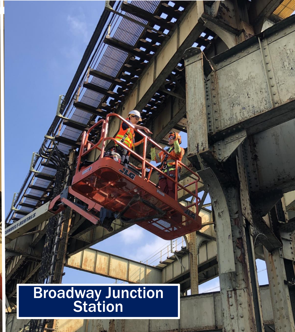
Broadway Junction Station