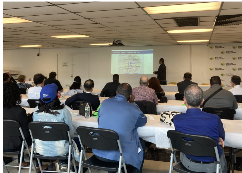
PSA Team presents at the New York Metropolitan Transportation Council (NYMTC) at the Hunts Point Produce Market, September 2024

The Community Outreach Team strives to keep the public informed on the status of the Project. We have continued to meet with Bronx Community Boards 2, 9, 10, and 11. In September 2024, we hosted our third meeting of the Bronx-Westchester Community Council and delivered our first briefing to the New York Metropolitan Transportation Council (NYMTC). NYMTC is the Metropolitan Planning Organization for the 10-county region that includes New York City's five boroughs.