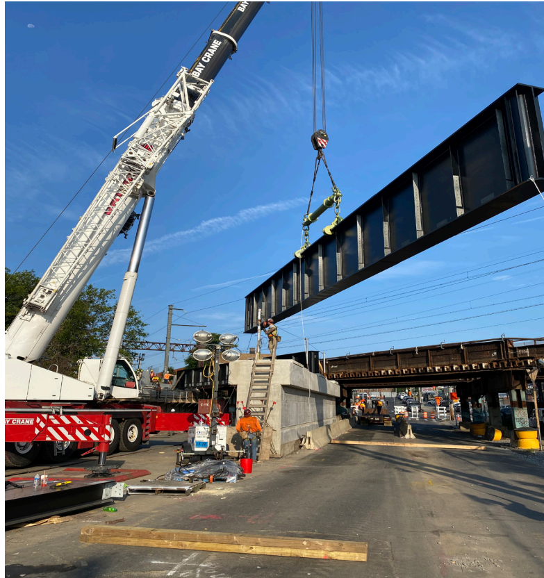
Crews erect new steel spans at Bronxdale Ave Bridge, August 2024

In August, crews installed two of four new steel spans at Bronxdale Avenue Bridge. To minimize impacts to the community, this complex task was accomplished during a single 55-hour weekend road closure.