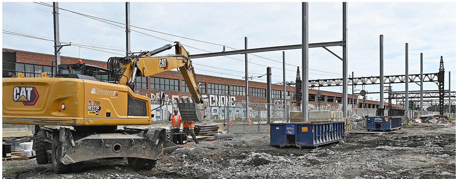
PSA crews progress site preparations at site of future Parkchester/Van Nest Station, August 2024

Work is ramping up at the site of the future Parkchester/Van Nest Station. Concrete foundation work, including walls, pile caps, grade beams, and elevator foundations, is ongoing and expected to be completed by the end of the year. Crews will also continue to progress drainage, caissons, and signal work north of Track 1 near the station site. The next phase of work at this location includes utility installation and pouring the concrete slab for the station entrance. Later in 2025, crews will commence steel erection and begin work on the station house walls. At Leggett Interlocking, signal, communication, and testing are underway with commissioning planned for the coming months.