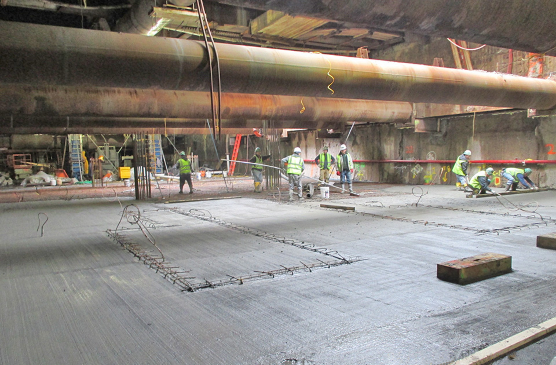
Mezzanine Slab Work Completed on February 14, 2014 Looking North between 96 th and 97 th Streets