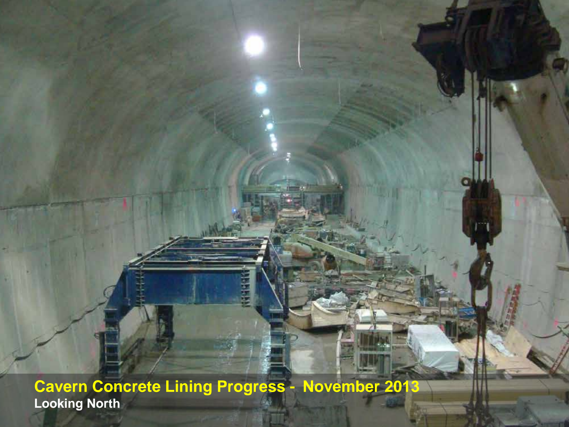
Cavern Concrete Lining Progress - November 2013 Looking North