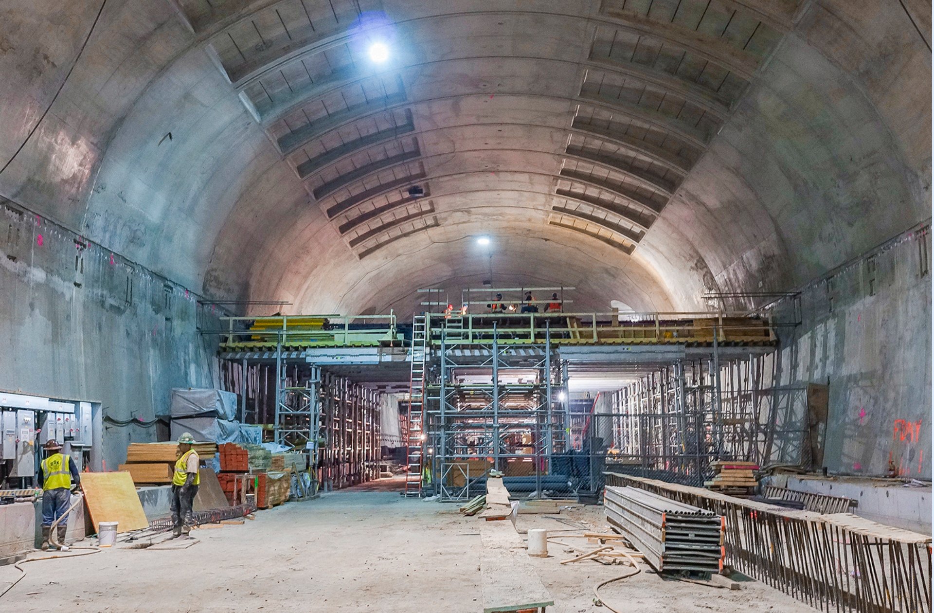
Mezzanine Slab Work - February 4, 2014 Looking North