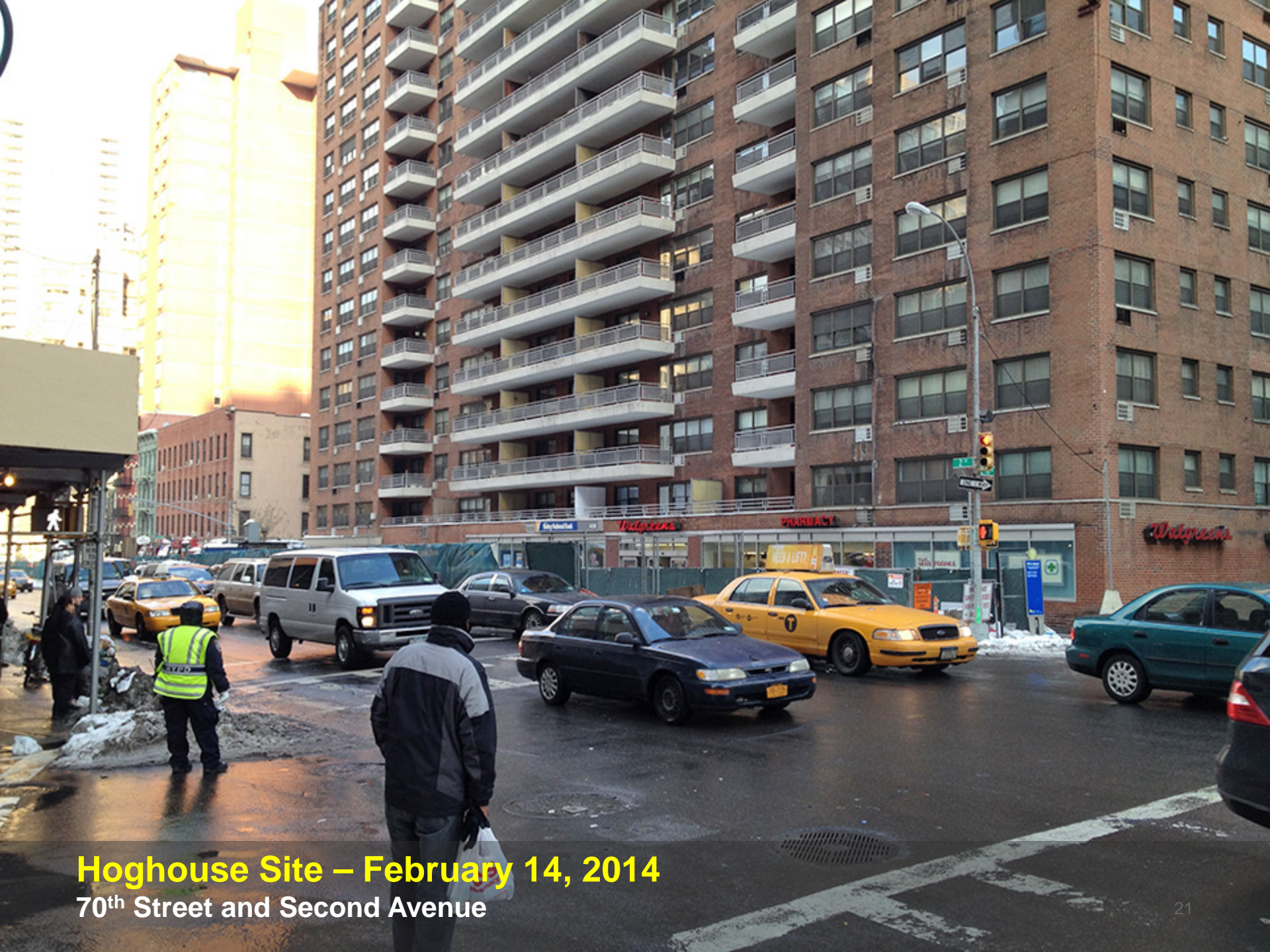
Hoghouse Site – February 14, 2014 70 th Street and Second Avenue