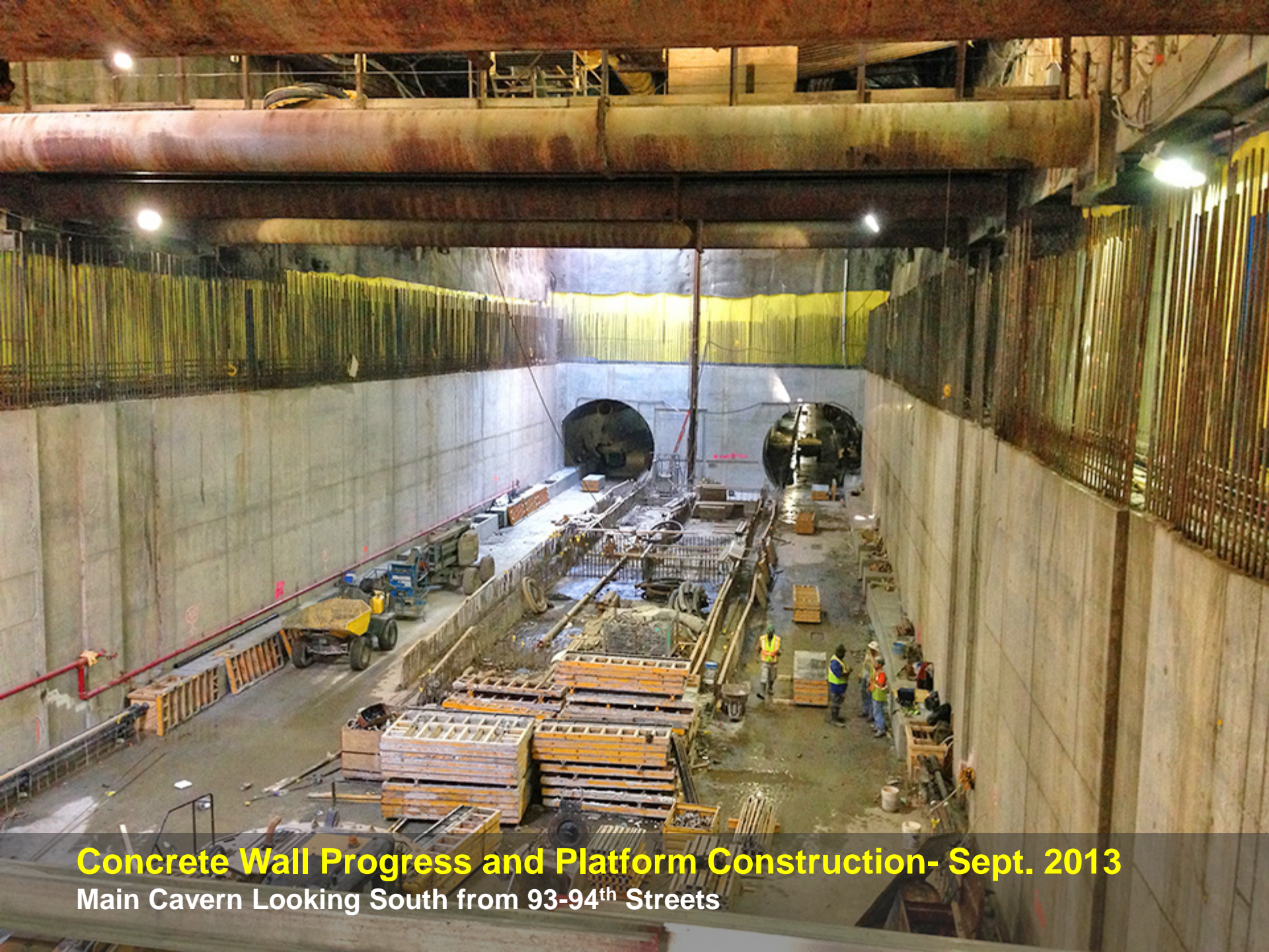
Concrete Wall Progress and Platform Construction- Sept. 2013 Main Cavern Looking South from 93-94 th Streets