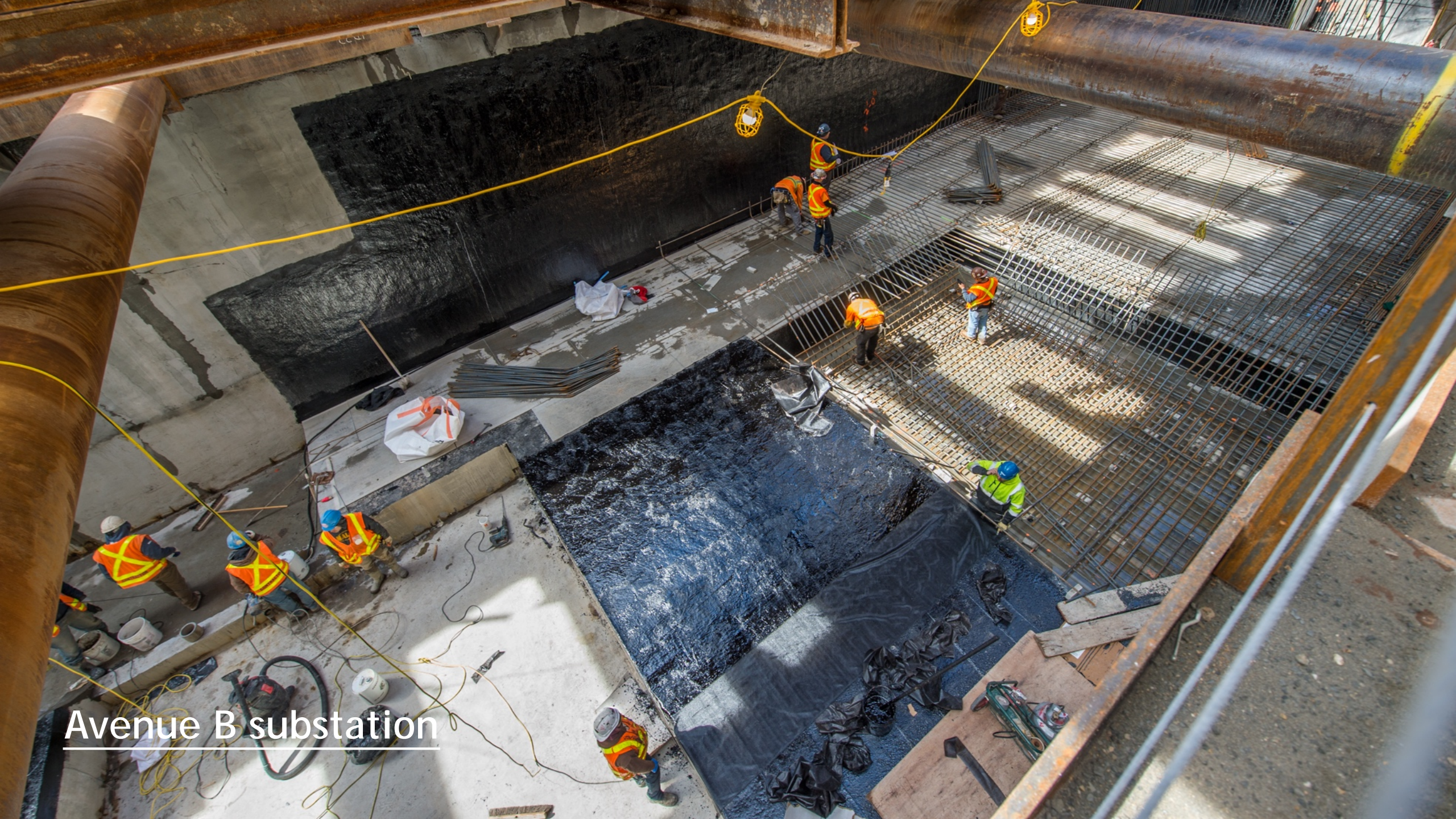
Avenue B substation