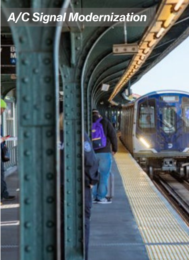
A/C Signal Modernization