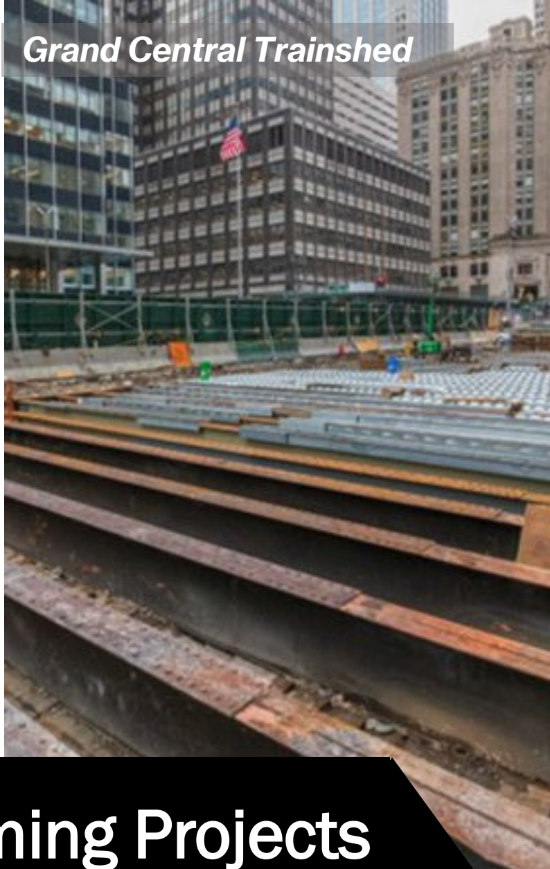
Grand Central Trainshed