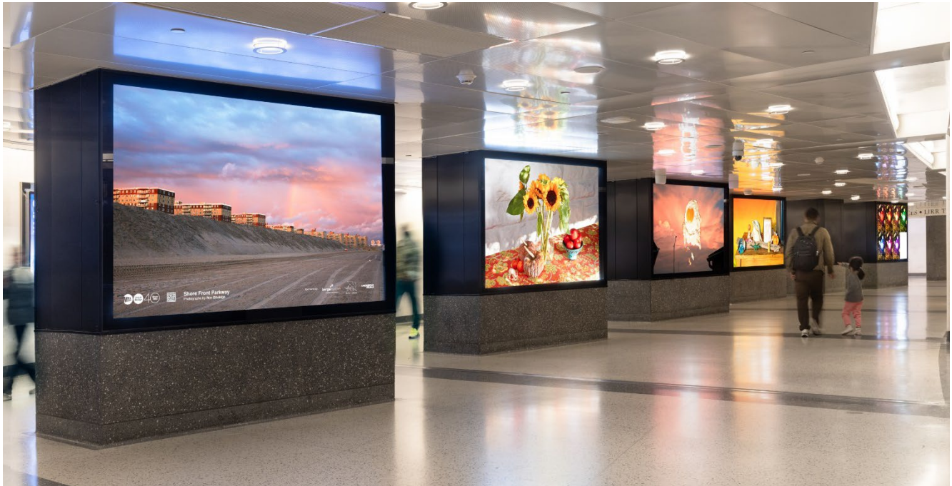
Beach Umbrellas/Shore Front Parkway (2025) © Roe Ethridge, LIRR Grand Central Madison. Commissioned by MTA Arts & Design. Photo: Jason Mandella.

Set in lightboxes at the 42 St-Bryant Park station, Lionel Cruet's photographic installation #seen presents a series of highly saturated, tinted images that recede toward a vanishing point. The title references digital culture—specifically the moment when a message or image is marked as “seen”—and explores how images are mediated, circulated, and perceived. The installation begins with a black-and-white photograph of the artist's hand holding a shell found along the Puerto Rican shoreline. As the sequence progresses, the images shrink in scale and incorporate public domain visuals from NASA and NOAA archives, including satellite imagery and oceanic heat maps. This shift from personal relationship with the environment to scientific documentation of larger climate trends invites viewers to contend with their own understanding of tropical environments. The result is a meditation on perception, environment, and the evolving role of photography in shaping how we think about place. The exhibition will remain on view through March 2026.