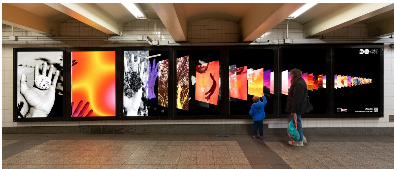
#seen (2025) © Lionel Cruet, NYCT 42 St-Bryant Park. Commissioned by MTA Arts & Design.

(NEW YORK, NY — November 18, 2025) MTA Arts & Design has unveiled new installations for its Photography and Poetry in Motion programs. At Grand Central Madison and 42 St-Bryant Park subway station, two lens-based exhibitions reflect on distinct New York communities. Two new poems are now on display across the MTA system, appearing in print and on digital screens in subway cars and platforms, commuter rail trains, and Metro-North Railroad and Long Island Rail Road stations, including Grand Central Terminal and Grand Central Madison. Selected in collaboration with the Poetry Society of America, the poems are thoughtfully paired with artworks from the MTA Arts & Design collection, creating a layered experience of language and visual art for riders.