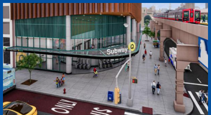
Renderings of the Second Avenue Subway 125 th Street Station

Visit the Second Avenue Subway Community Information Center!