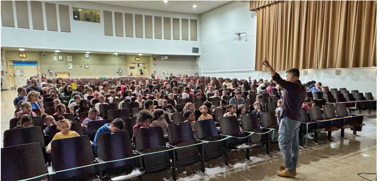
SASP2 Program addressing students at River East Elementary

Student Ambassador Program: We are excited to announce that Esperanza Preparatory Academy, located in the Tito Puente Education Complex on 109th Street, has joined the Second Avenue Subway Student Ambassador Program. The program works with local schools to bring the science, technology, engineering, art, and math (STEAM) of building the Second Avenue Subway, right into the classroom.