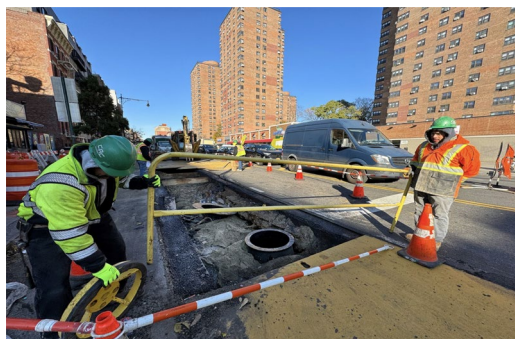
Excavation on 106 th Street