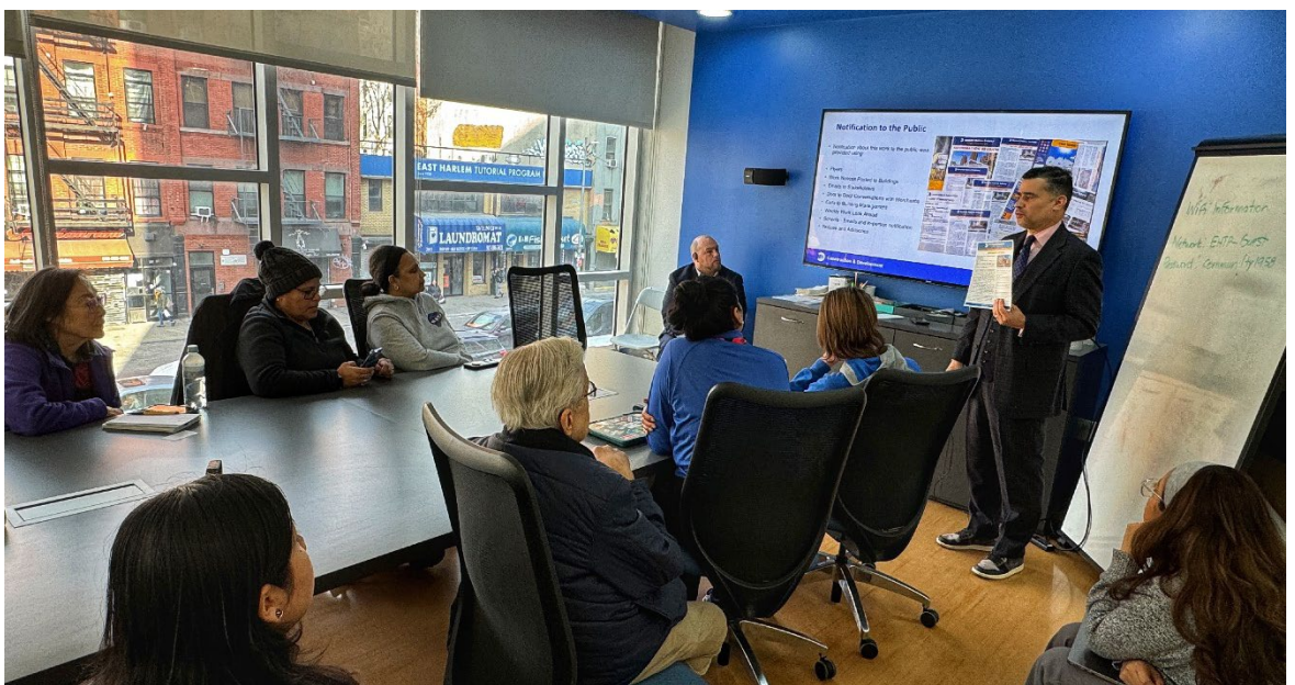
Advisory Committee members receive a status update from the MTA

The Second Avenue Subway Phase 2 Construction Residential Advisory Committee met on January 21, 2025 for a project update about the ongoing construction. The committee reviewed the upcoming work and discussed any concerns brought to the attention of the MTA during the last quarter.