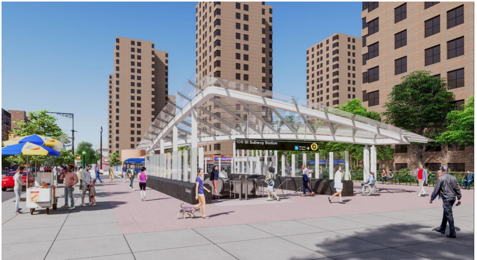
Conceptual rendering of SASP2 entrance at northeast corner of 106 th St. and Second Avenue