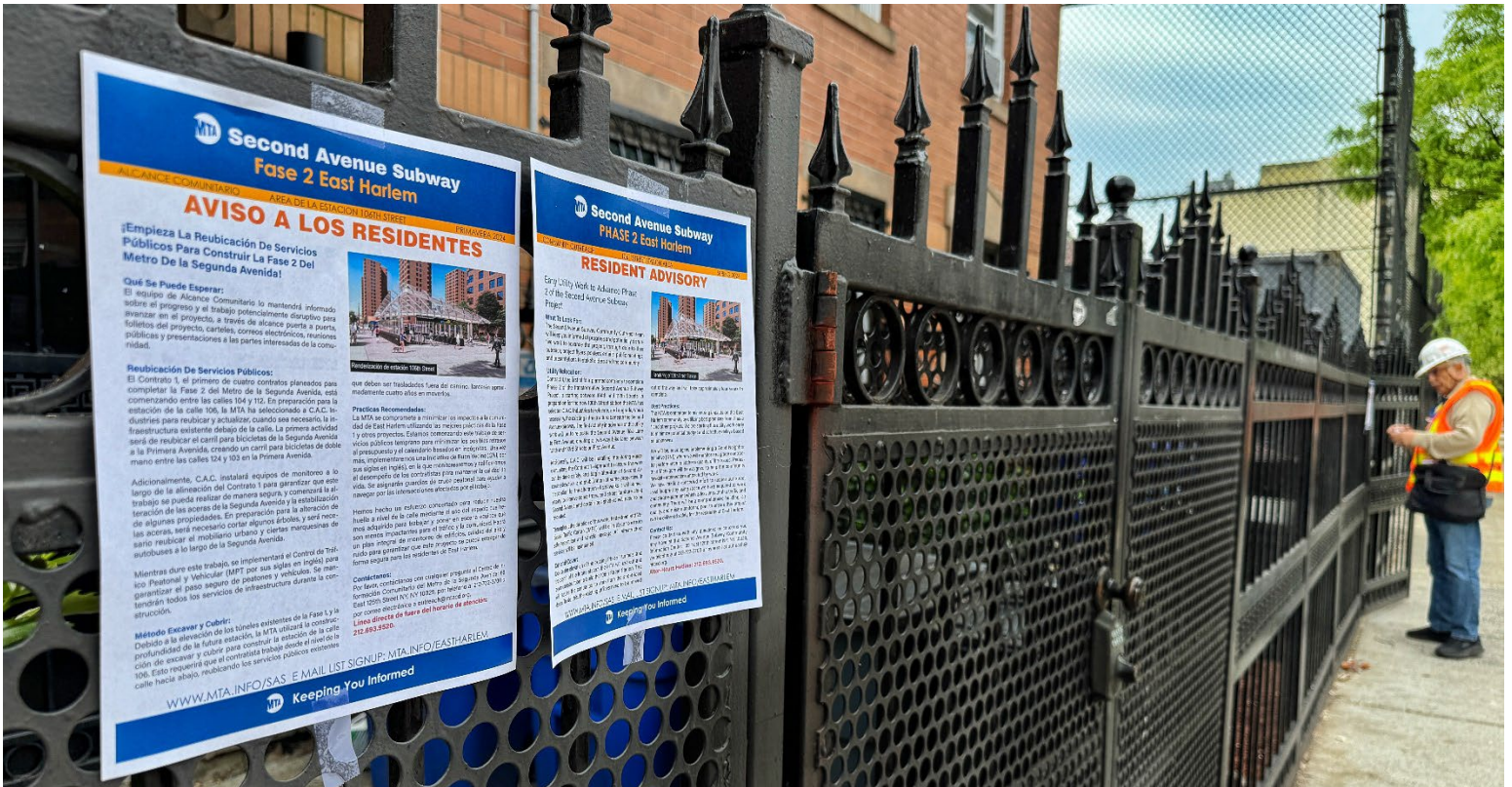
Multi-Language Resident Advisory Notices

As part of our commitment to keep you informed, you may have noticed signage posted on buildings and along the Second Avenue Subway construction area. Most often, those notifications to the public indicate the work that is being carried out along the alignment such as water shutdowns, night work, parking regulation changes, and electrical utility relocation.