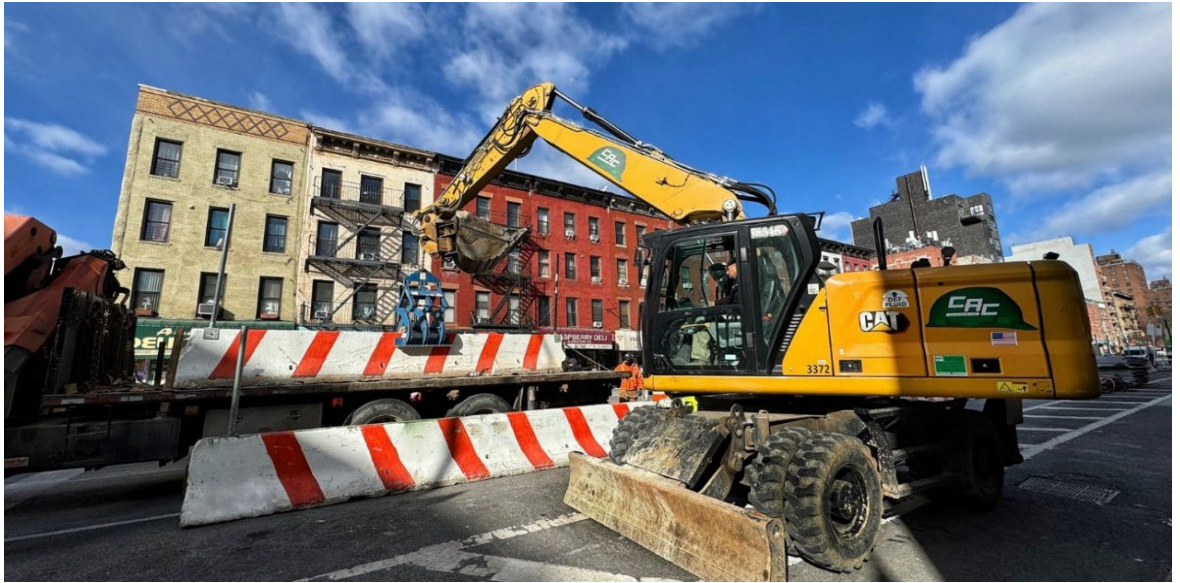
Excavator installing protective jersey barriers on Second Avenue

Work is progressing for utility relocation on Second Avenue. This construction will build on electrical and water main work completed on the side streets in 2024, on 105 th , 106 th , 108 th , 109 th , and 110 th Street. The contractor continues to advance pre-construction surveys and the installation of monitoring equipment in preparation for the future excavation on Second Avenue. Work in the coming months will include installation of utility vaults, and ongoing utility relocation on the east side of Second Avenue.