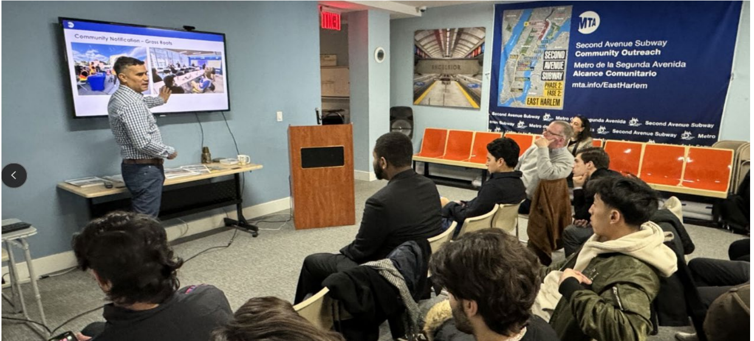
NYU students attend briefing at the Community Information Center

Did you know that the Second Avenue Subway project has a Community Information Center on 125th Street. The center provides information about how Phase 2 will be constructed, complete with interactive kiosks and videos detailing how the work will be completed in the upcoming years.