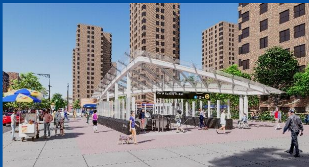
Rendering of the Second Avenue Subway 106 th Street Station

On October 14 th and on October 21 st MTACD and the Second Avenue Subway Community Outreach team held the project's quarterly Construction Advisory Committee meetings. These Construction Advisory Committee meetings enable residents and merchants with greater than one-to-one reach to hear current construction updates, and provides a forum for attendees to share their ideas and voice any concerns about the ongoing construction.