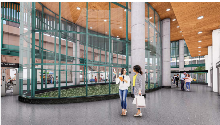
Interior of Entrance 3 at Park Avenue