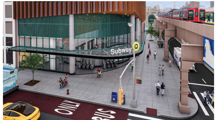
Entrance 3 at 125th Street proximate to Metro-North Railroad