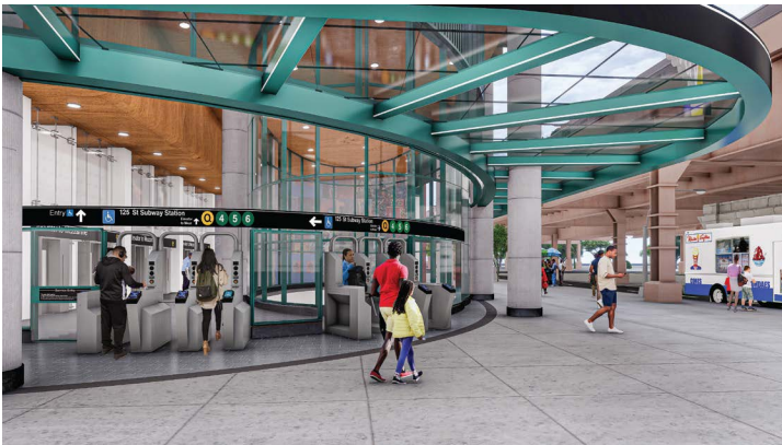
125th Street Entrance 3 at Park Avenue

Phase 2 of the Second Avenue Subway will further reduce congestion on the 4, 5, and 6 lines by drawing an expected 100,000 daily riders, transporting East Harlem and Bronx riders with faster commutes, fewer delays, greater reliability, and more connectivity to subway and regional transit.