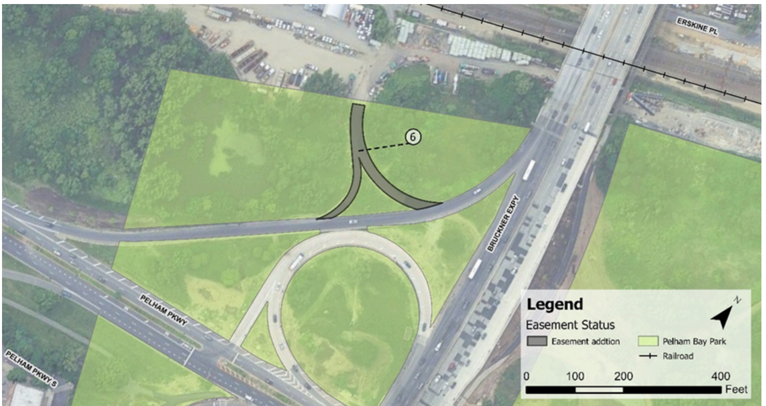
Figure 2: Additional easement (section 6)