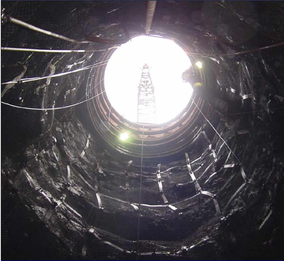
Example of shaft site used to insert or remove machinery, spoils or tunnel workers