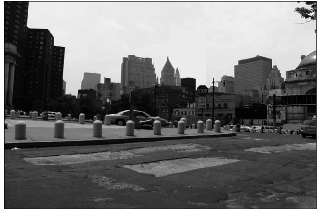
South side of Canal Street, view west from Chrystie Street 10