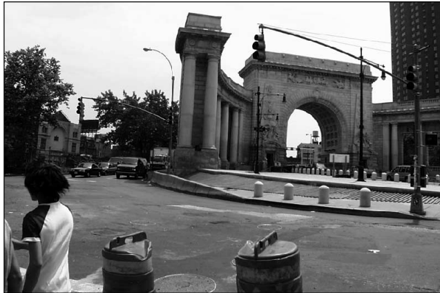
Manhattan Bridge entrance, view east from Bowery 9