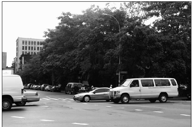
West side of Chrystie Street, view south from Stanton Street 6