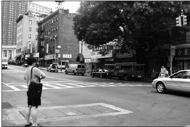
West side of Chrystie Street, view south from Hester Street 7