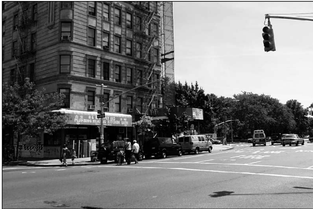
East side of Second Avenue, view south from 1st Street 3