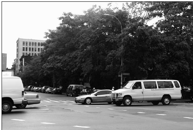
West side of Chrystie Street, view south from Houston Street 5