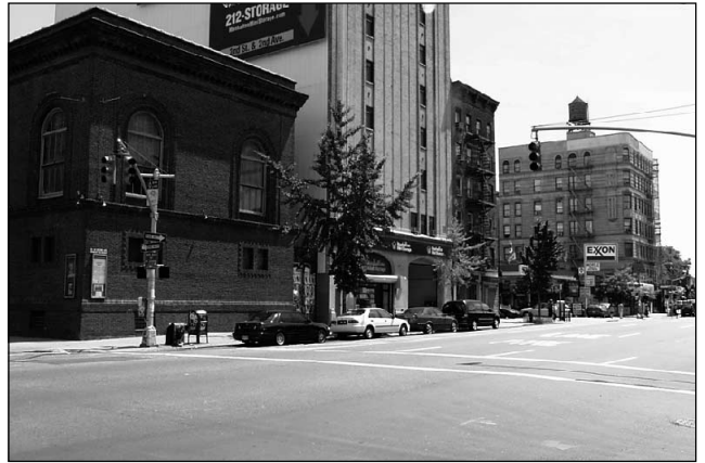
East side of Second Avenue, view south from 2nd Street 2