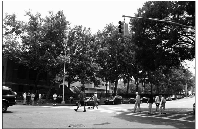
East side of Chrystie Street, view south from Hester Street 8