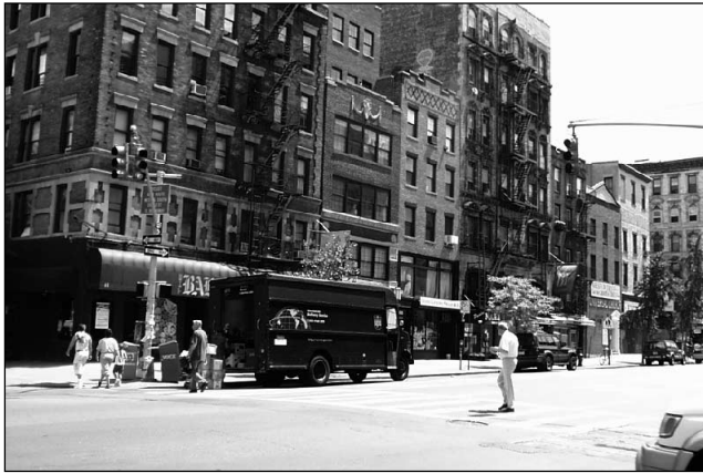
East side of Second Avenue, view south from 4th Street 1