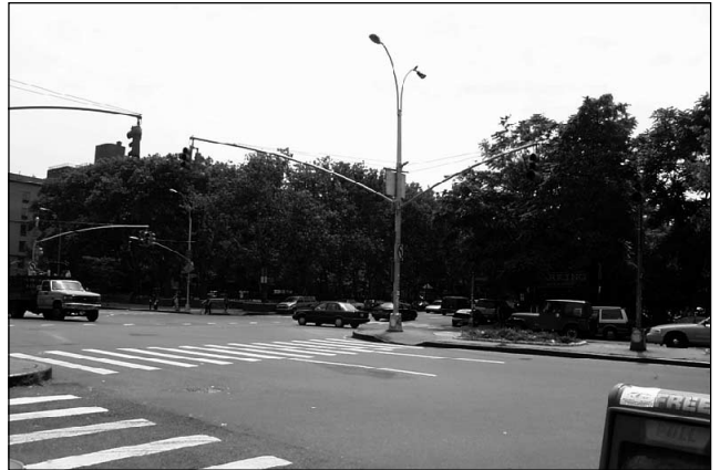
East side of Chrystie Street, view south from Houston Street 4