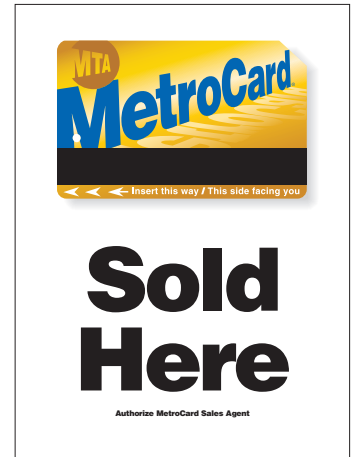
Window Posters 8 1/2" x 11", 11" x 15", 17" x 23"